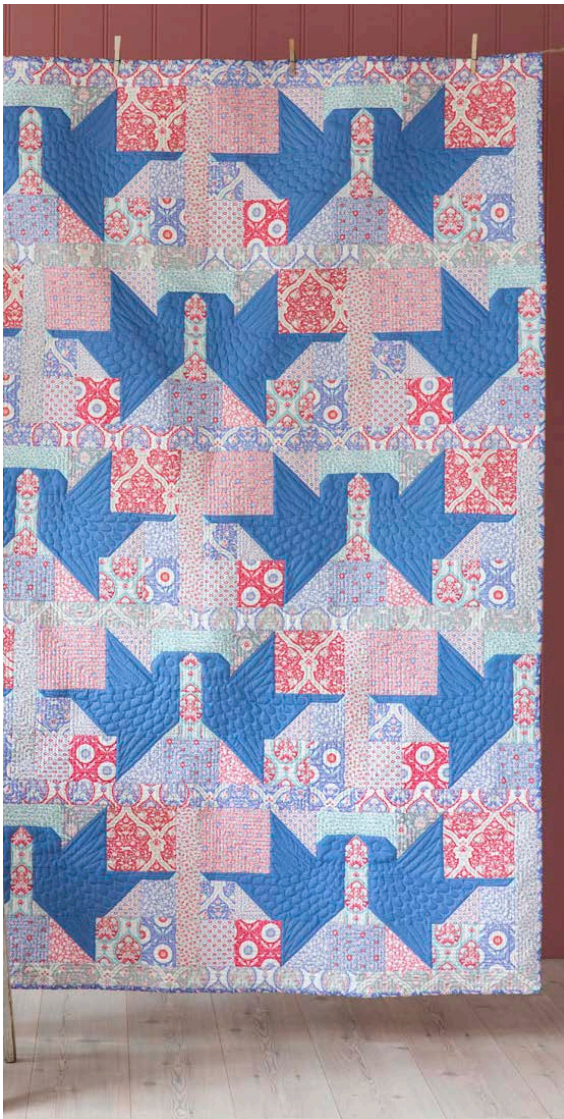
Mosaic Birds Quilt

This unusual quilt is quite easy to make with some careful measuring and machine piecing. It uses a patchwork block with two facing birds and two similar blocks with single birds. The birds are a lovely solid blue fabric, which makes their shapes stand out from the rest of the patchwork.