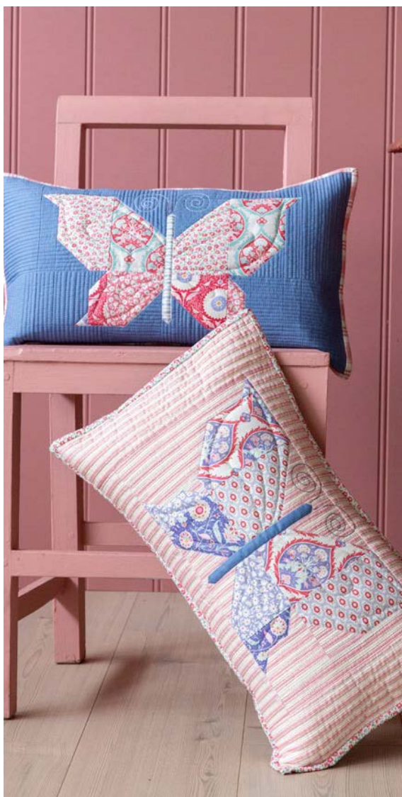
Mosaic Butterflies Pillows

If you have made the Mosaic Butterflies Quilt, there are two pillow designs that will make the perfect companions. One pillow has a blue background, like the quilt, while the other pillow has a red striped background. Both pillows are made the same way but with different fabrics.