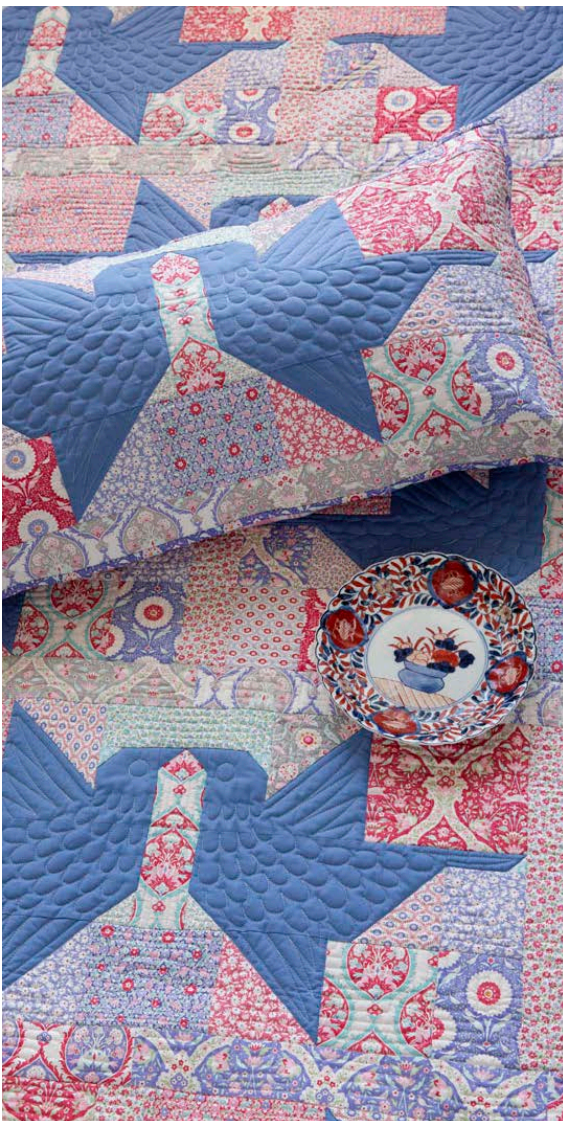
Mosaic Birds Pillow

This pretty pillow has been designed to match the Mosaic Birds Quilt, but it would be a lovely project to make on its own, perhaps as a gift for a friend. It uses just one Double Bird block that is made in the same way as the quilt.