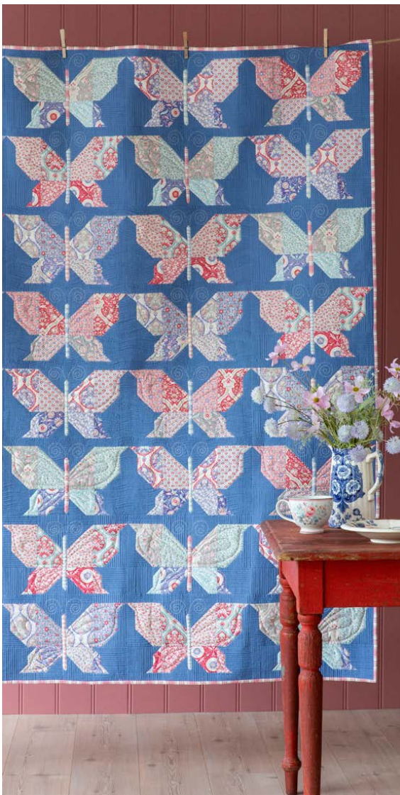
Mosaic Butterflies Quilt

There are also two pillow designs, which complement the quilt beautifully.