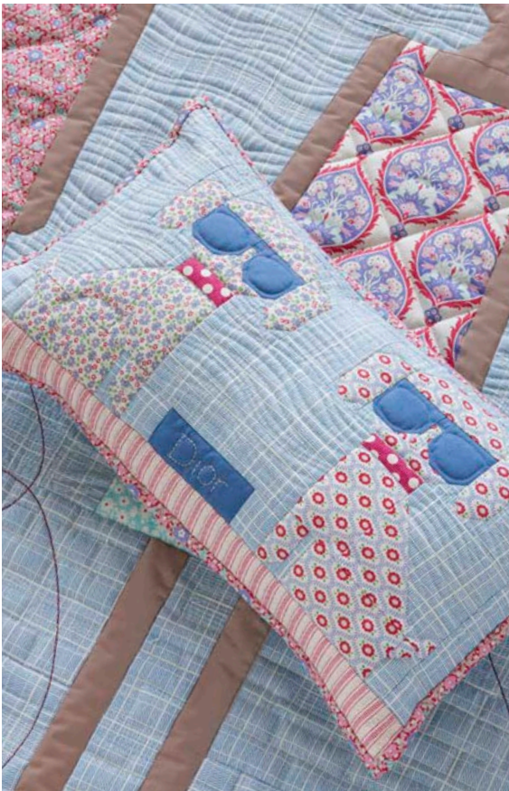
My Dog Pillow

This irresistible pillow is a must-sew project – after all, who could resist these adorable little dogs? The pillow has been designed to be a companion to the Me and My Dog Quilt (see tildasworld.com ), but it's perfect on its own too, whether sewn just for yourself, or your best buddy or a dog-loving friend.