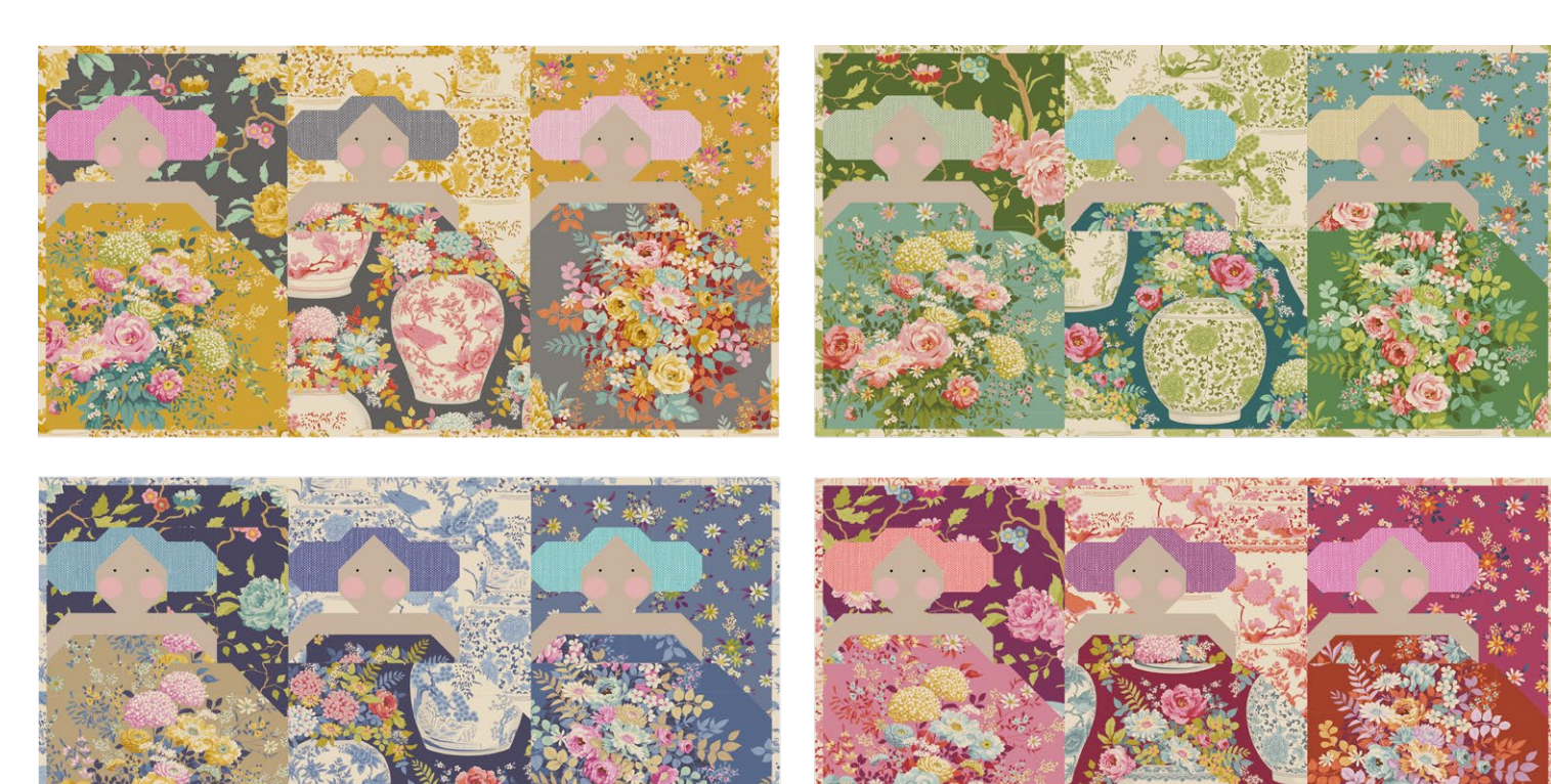
Cocktail Hour Pillows 26in x 13¾in (66cm x 35cm) 20220203 Yellow 20220204 Green 20220205 Blue 20220206 Pink