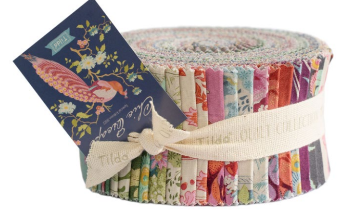
300137 Fabric Roll 2,5 in strips 40 pcs (2 of each)

Chic Escape will be our first Special Edition Collection.