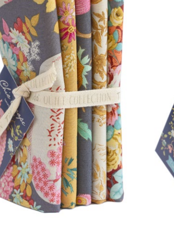
300130 Fat Quarter Bundle