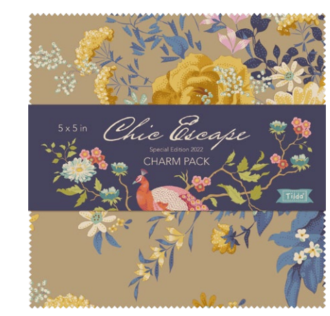
300135 Charm Pack 5 in squares, 40 pcs (2 of each)