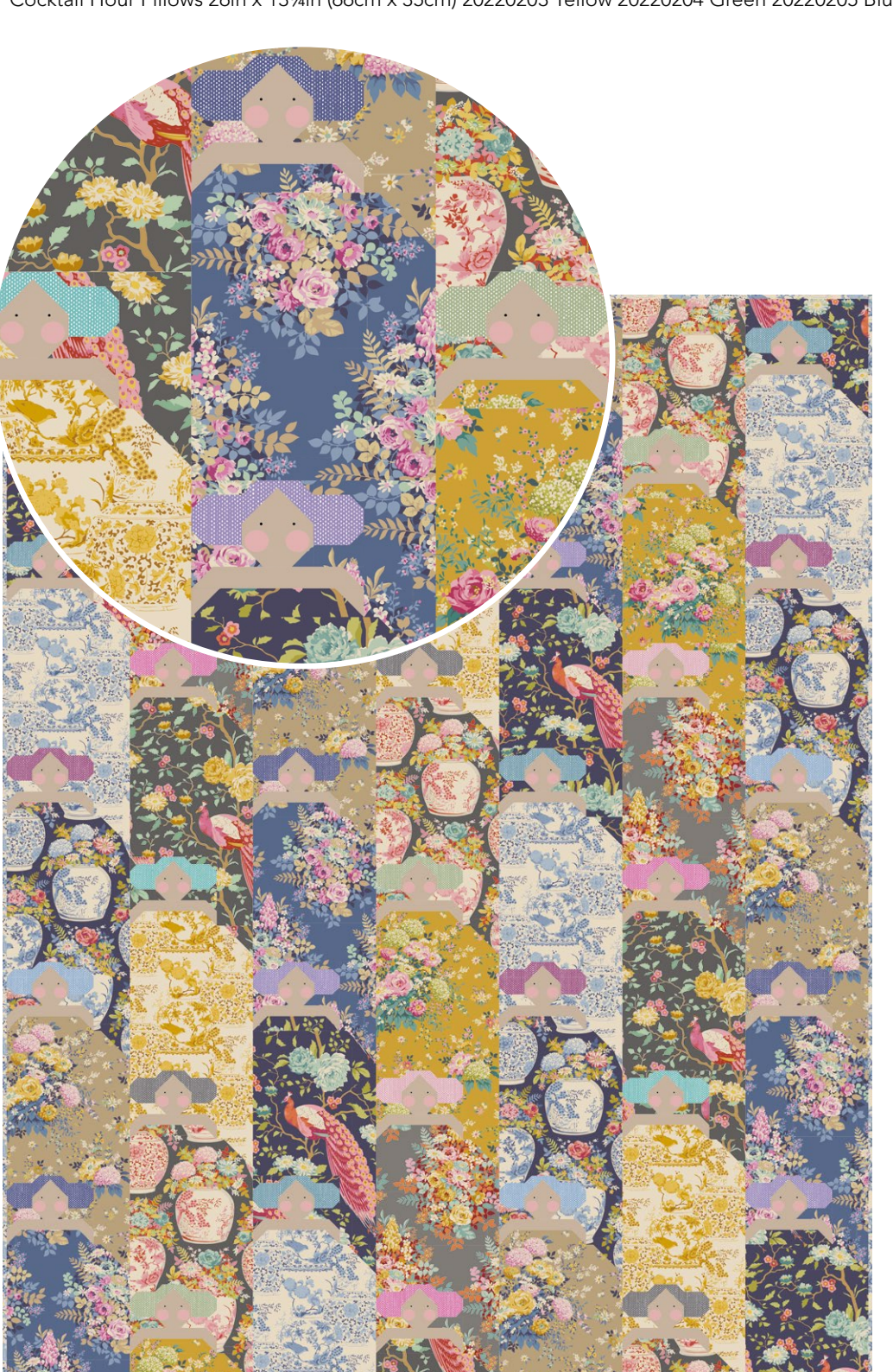
Cocktail Hour Quilt 60in x 75¾in (152.4cm x 192.4cm) 20220201 Blue/Yellow