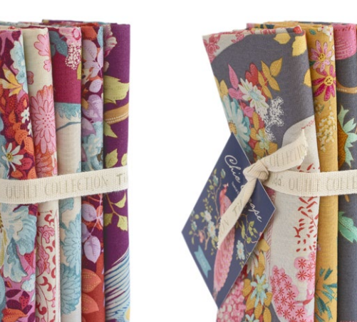
300128 Fat Quarter Bundle 300129 Fat Quarter Bundle 5 fabrics, 22x19,5 in 5 fabrics, 22x19,5 in Grape/Pink/Rust Grey/Mustard