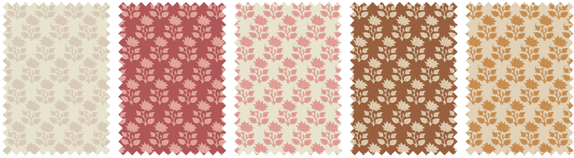
110104 Mira Cream 110105 Mira Rhubarb 110106 Mira Pink 110107 Mira Caramel 110108 Mira Ochre