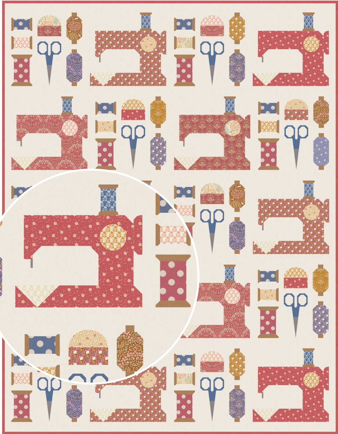
20240301 Make do and Mend Quilt Putty White 64 x 82,5 in (162,5 x 209,5)