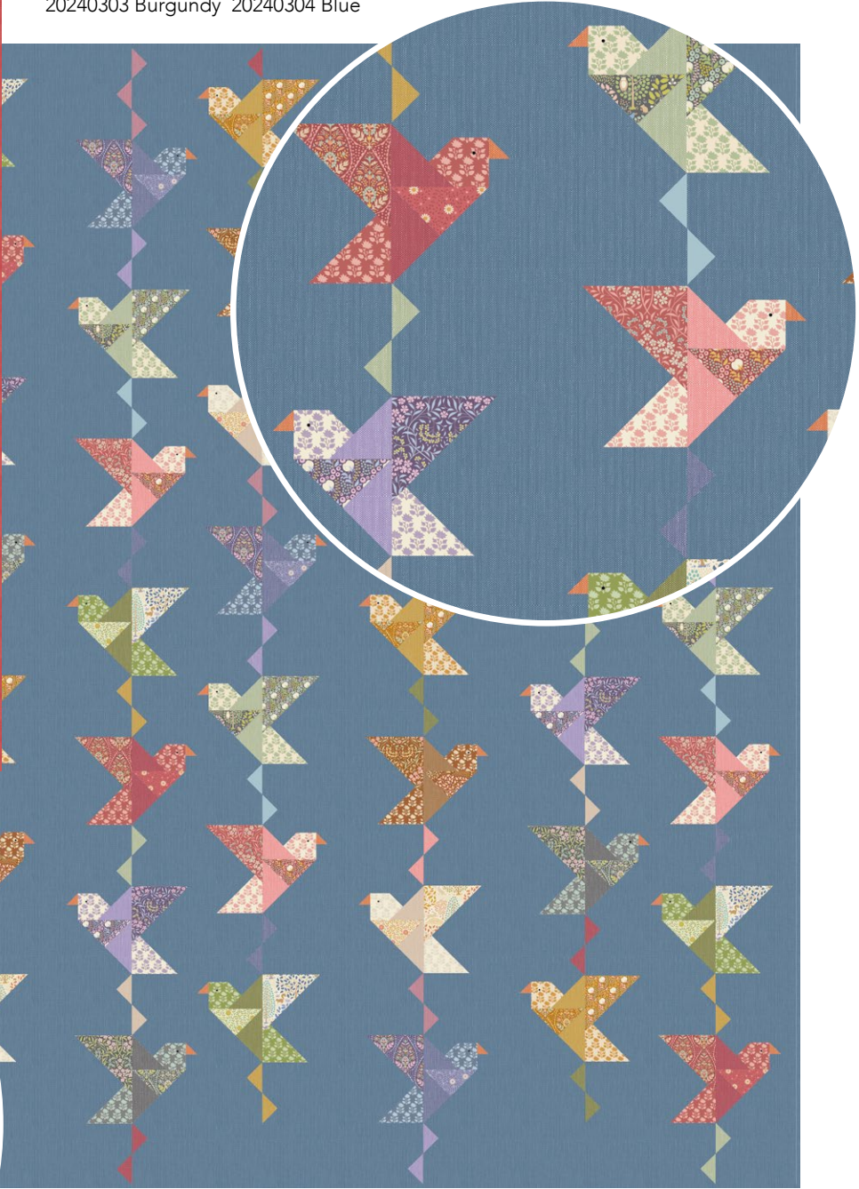
20240307 Paperbird Quilt Prussian 59,5 x 74,75 in (151 x 190 cm)