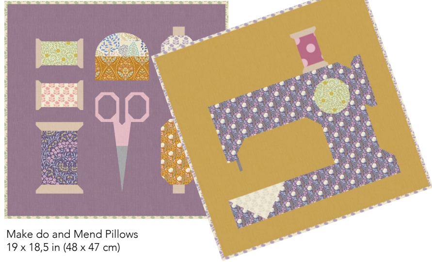
Make do and Mend Pillows 19 x 18,5 in (48 x 47 cm) 20240305 Eggplant 20240306 Mustard