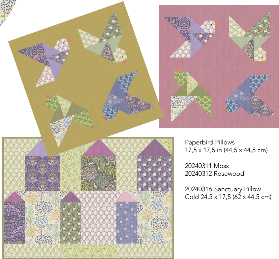
Paperbird Pillows 17,5 x 17,5 in (44,5 x 44,5 cm) 20240311 Moss 20240312 Rosewood 20240316 Sanctuary Pillow Cold 24,5 x 17,5 (62 x 44,5 cm)