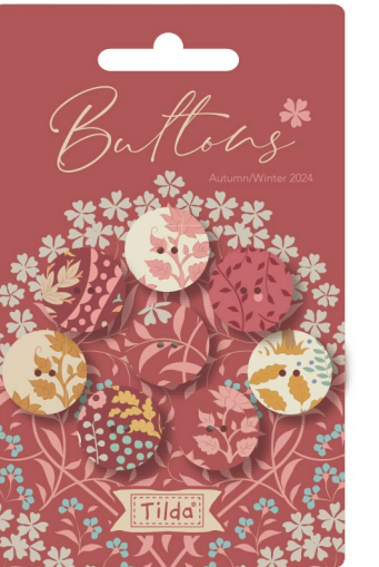
400066 Sanctuary Buttons 0,72 in (18mm) 8 pcs

For so many of us, the sewing room is our ultimate sanctuary. This sanctuary is depicted in the Make Do and Mend Quilts.