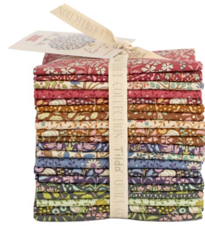
300202 Fat Eight Bundle 20 fabrics, 20x11 in