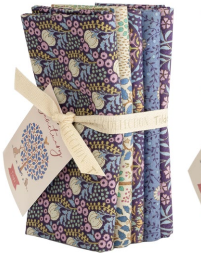
300198 Fat Quarter Bundle 5 fabrics, 20x22 in Eggplant/Blue