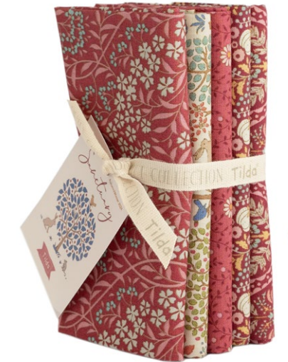
300196 Fat Quarter Bundle 5 fabrics, 20x22 in Maroon/Rhubarb