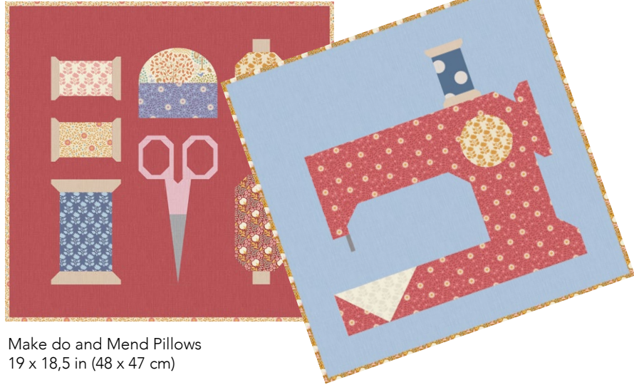
Make do and Mend Pillows 19 x 18,5 in (48 x 47 cm) 20240303 Burgundy 20240304 Blue