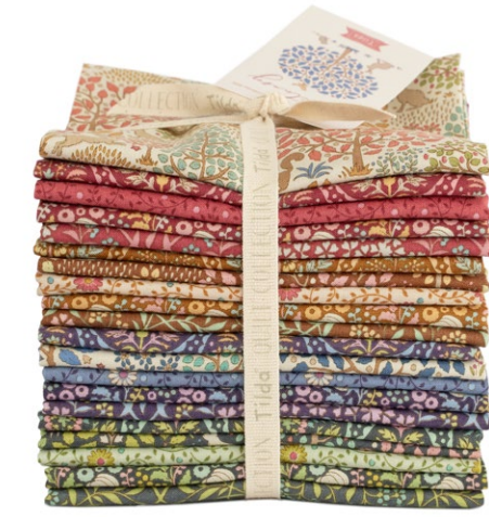
300201 Fat Quarter Bundle 20 fabrics, 20x22 in