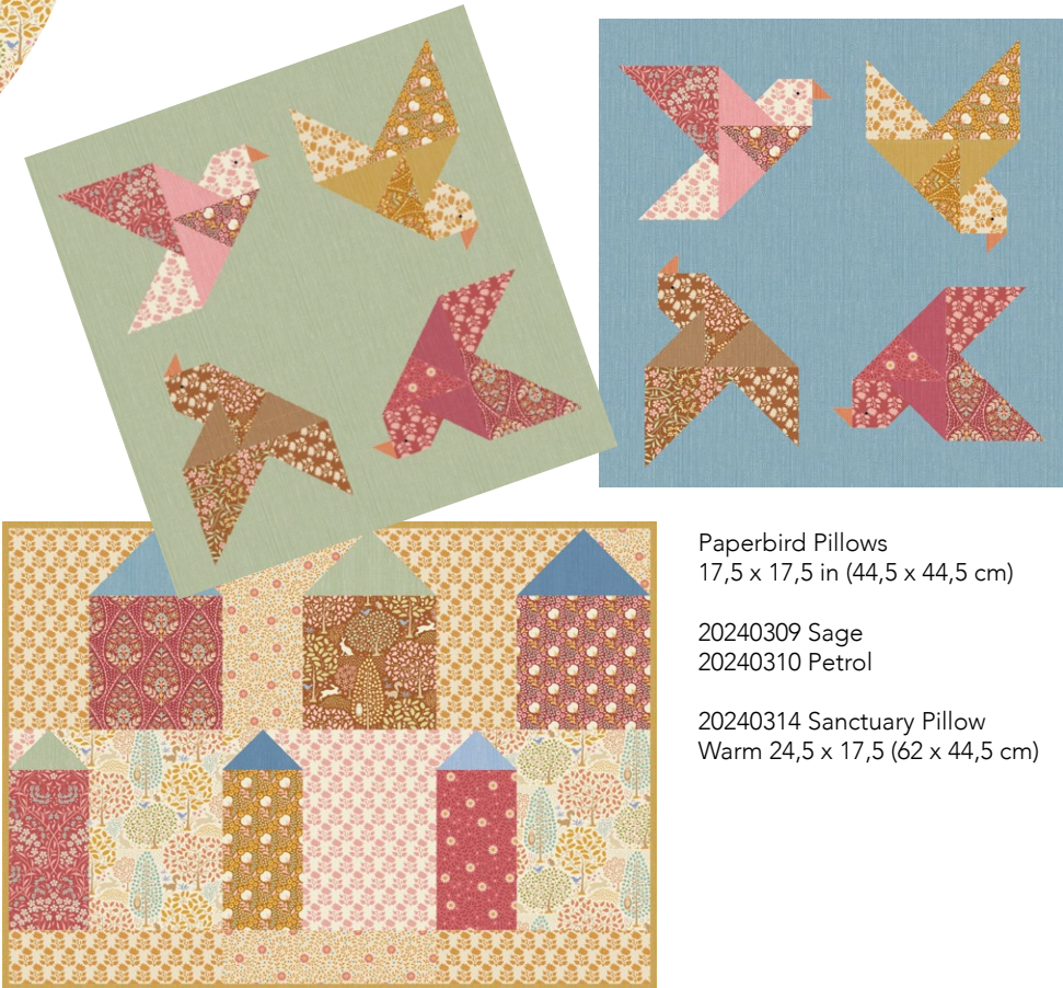
Paperbird Pillows 17,5 x 17,5 in (44,5 x 44,5 cm) 20240309 Sage 20240310 Petrol 20240314 Sanctuary Pillow Warm 24,5 x 17,5 (62 x 44,5 cm)