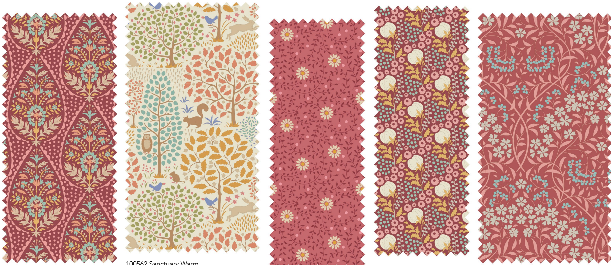
100561 Adina Maroon 100562 Sanctuary Warm 100563 Daisydream Rhubarb 100564 Cottonfield Maroon 100565 Larissa Rhubarb