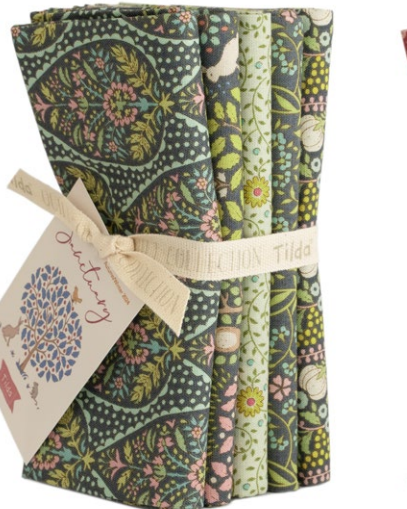
300199 Fat Quarter Bundle 5 fabrics, 20x22 in Green/Grey