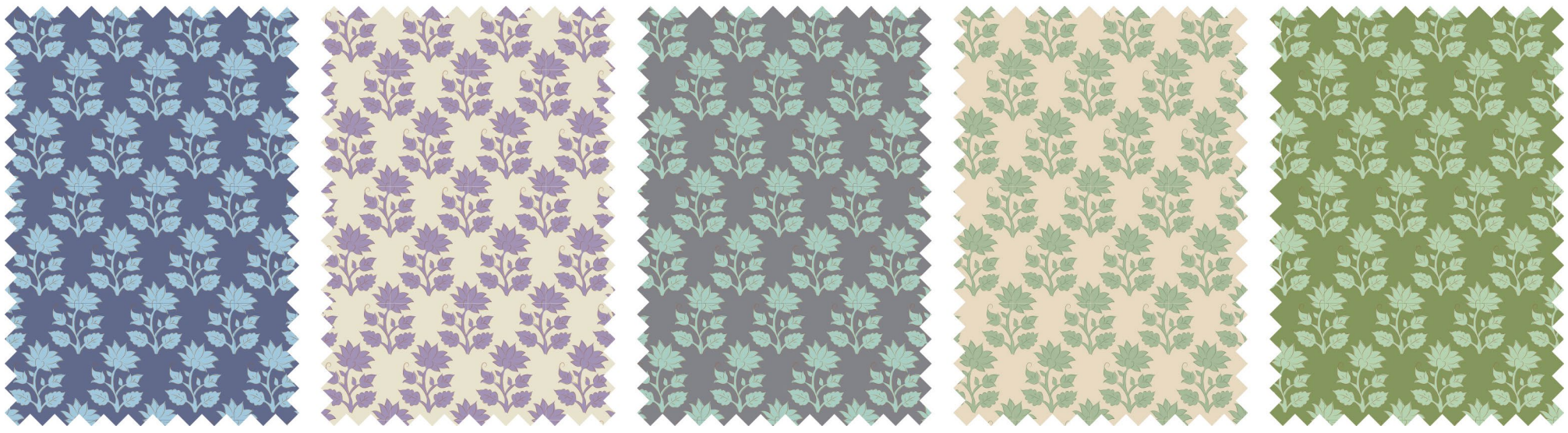
110109 Mira Blue 110110 Mira Lavender 110111 Mira Slate 110112 Mira Sage 110113 Mira Moss