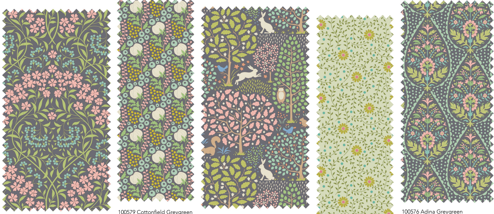
100580 Larissa Greygreen 100579 Cottonfield Greygreen 100577 Sanctuary Greygreen 100578 Daisydream Pistachio 100576 Adina Greygreen