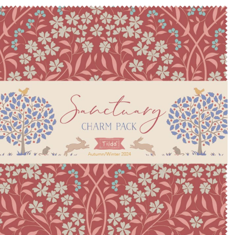
300203 Charm Pack 5 in squares, 40 pcs (2 of each)