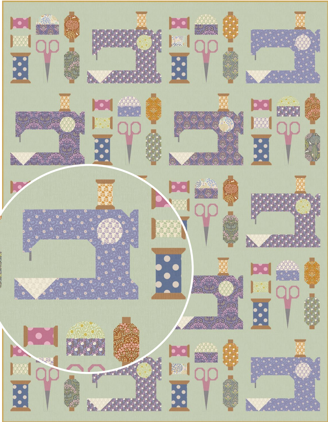
20240302 Make do and Mend Quilt Sage 64 x 82,5 in (162,5 x 209,5)