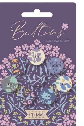
400067 Sanctuary Buttons 0,63 in (16mm) 8 pcs