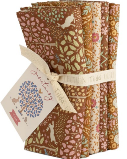
300197 Fat Quarter Bundle 5 fabrics, 20x22 in Caramel/Ochre