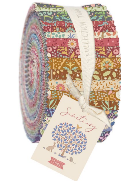
300205 Fabric Roll 2,5 in strips 40 pcs (2 of each)