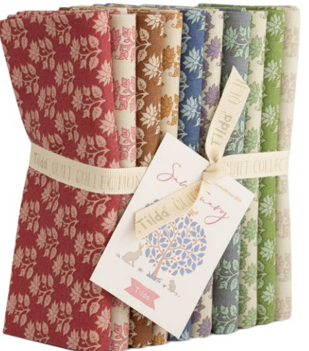
300200 Fat Quarter Bundle 10 fabrics, 20x22 in Mira