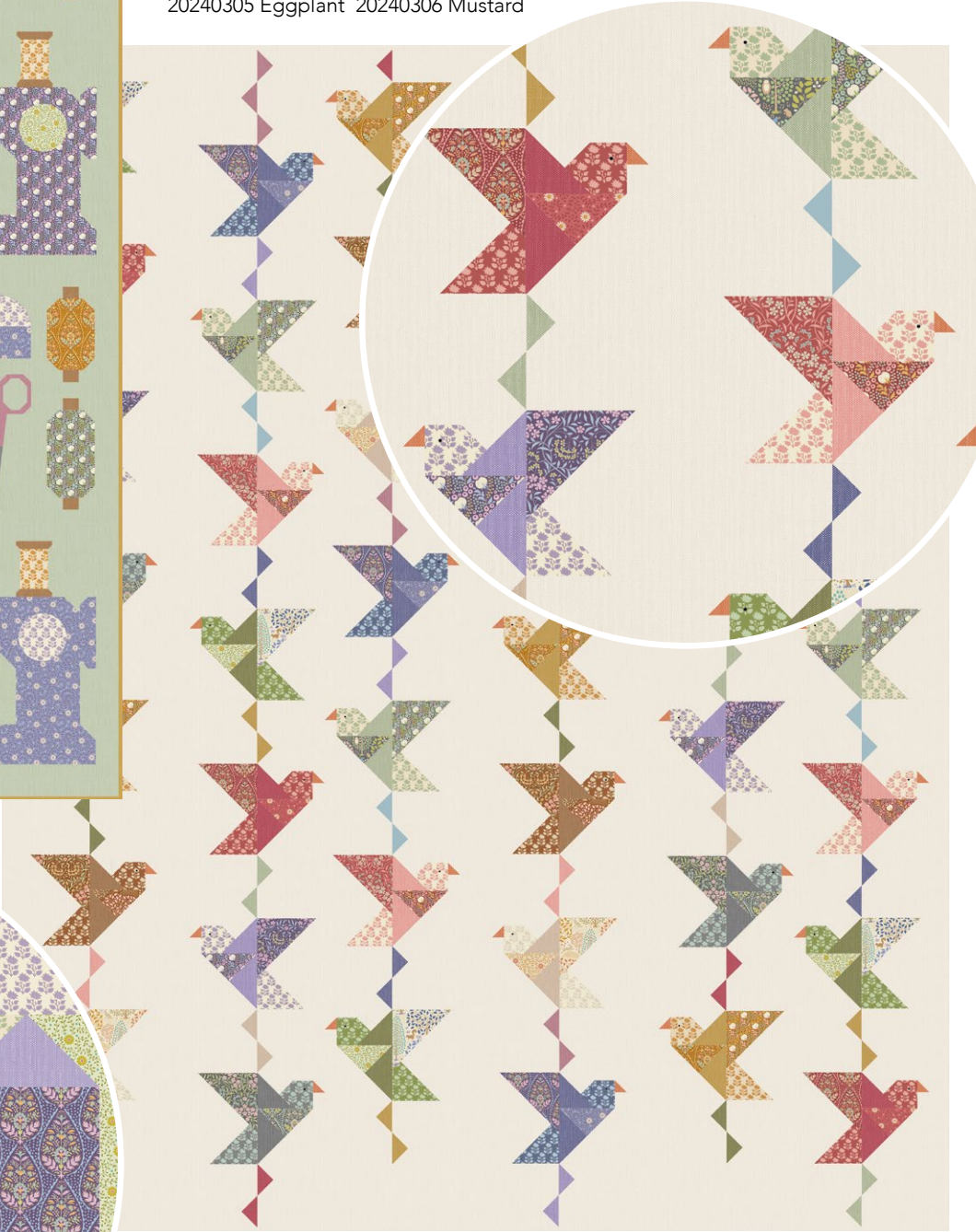
20240308 Paperbird Quilt Putty White 59,5 x 74,75 in (151 x 190 cm)