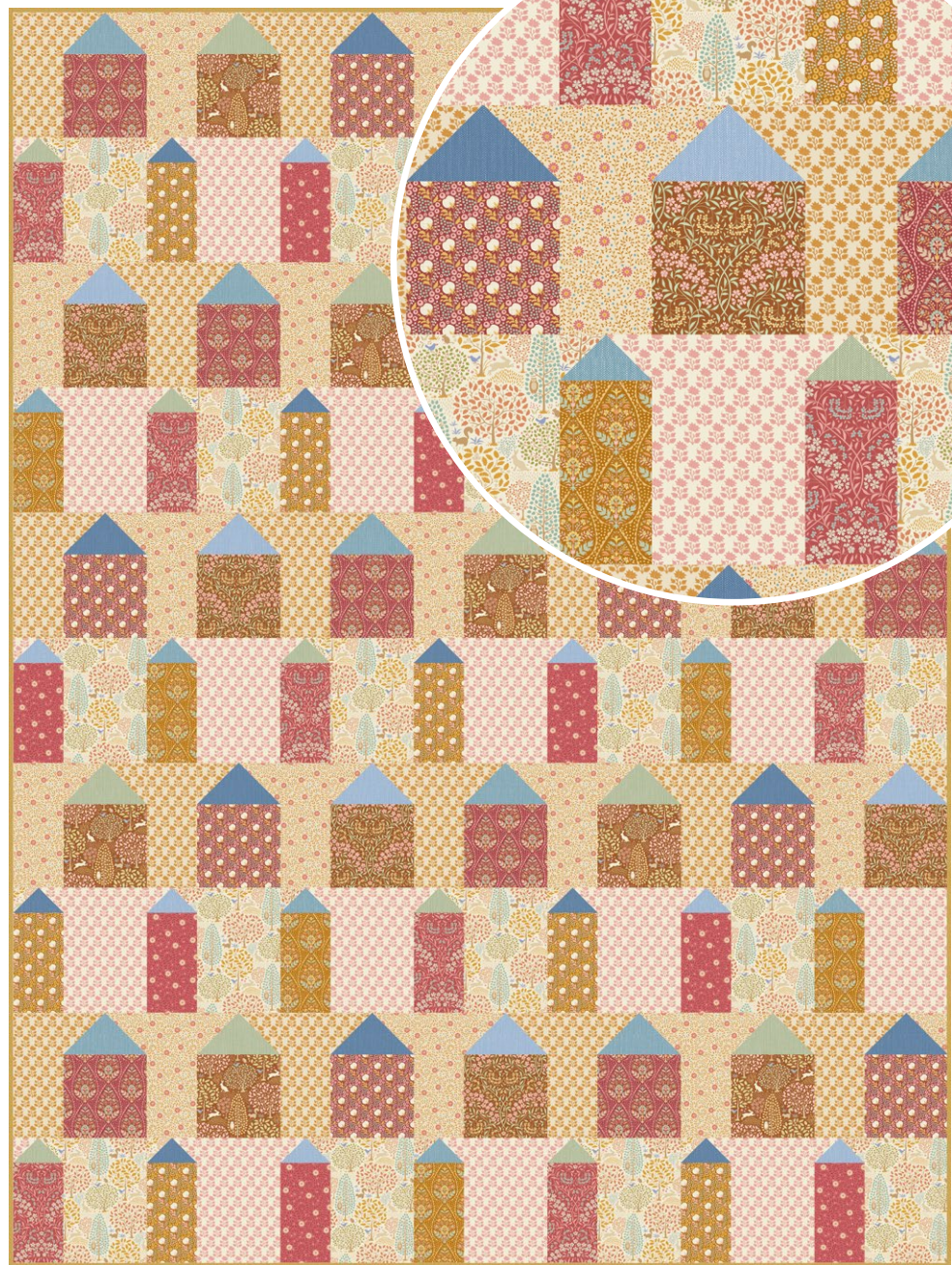
20240313 Sanctuary Quilt Warm 56,5 x 75,5 (143,5 x 192 cm)