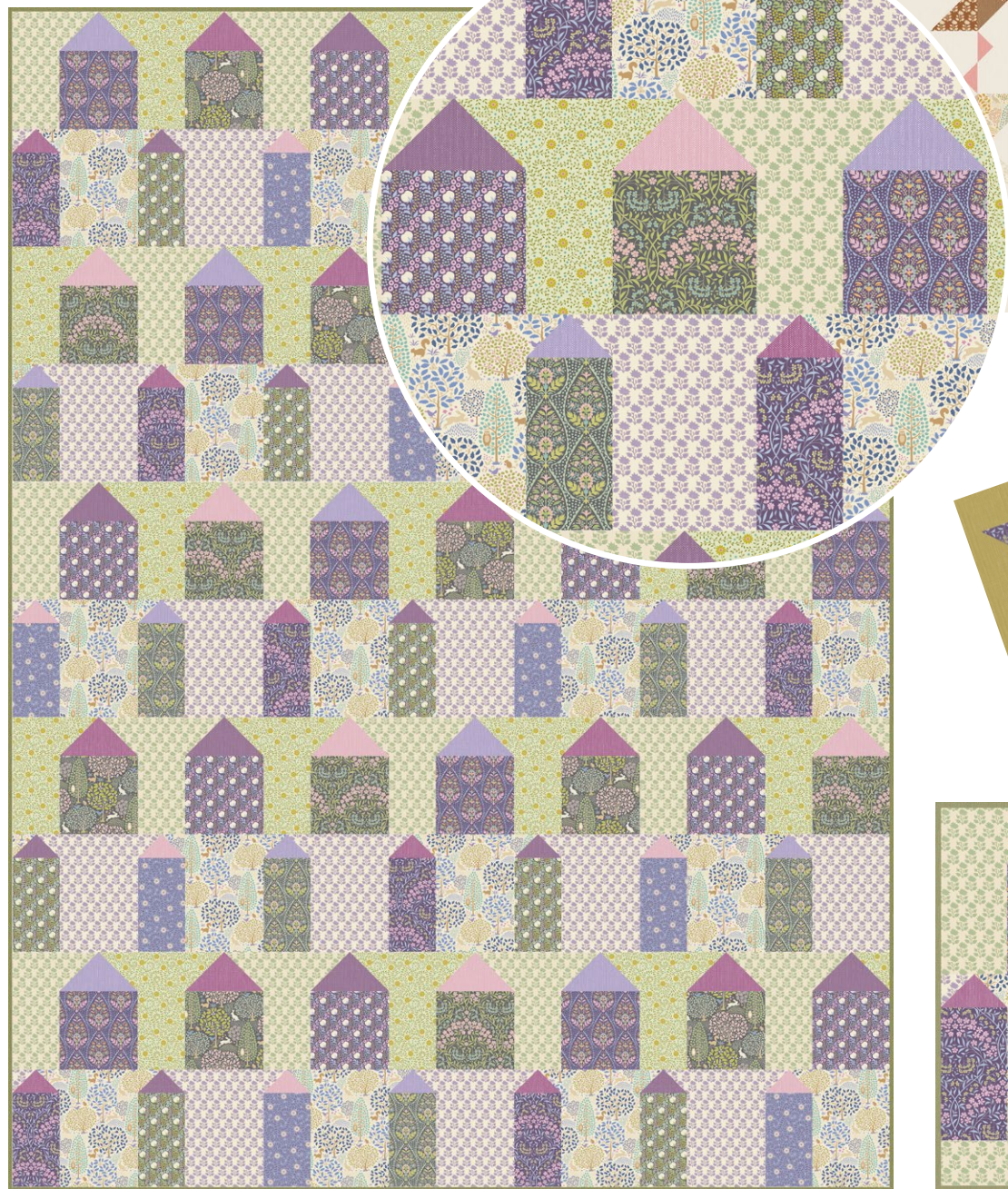
20240315 Sanctuary Quilt Cold 56,5 x 75,5 (143,5 x 192 cm)