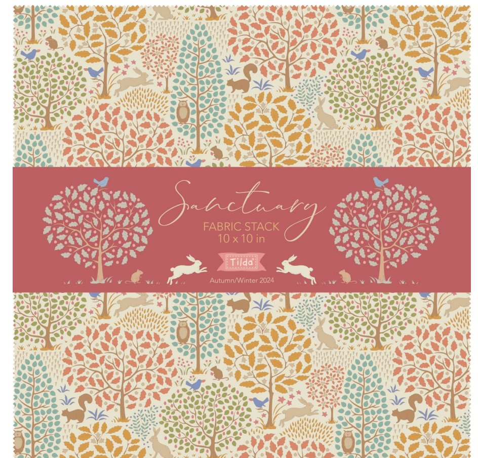
300204 Fabric Stack 10 in squares, 40 pcs (2 of each)